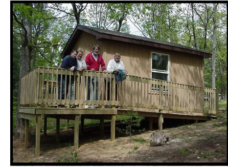
One of the Beautiful Rental Cabins

We welcome families, couples, singles and children of all ages. We have a modern playground and we are a family oriented club. We do ask that first time visitors come during our scheduled hours.