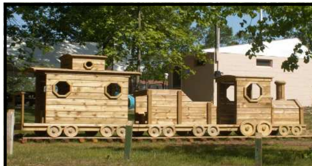
Members got together to build the The Buzz Express Kids Train

We welcome families, couples, singles and children of all ages. We have a modern playground and we are a family oriented club. We do ask that first time visitors come during our scheduled hours.